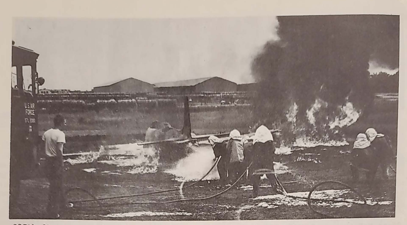
937th firemen were kept in practice with simulated aircraft fires.